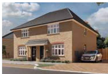
L&Q at Willow Grove Wixams lqhomes.com/willowgrove