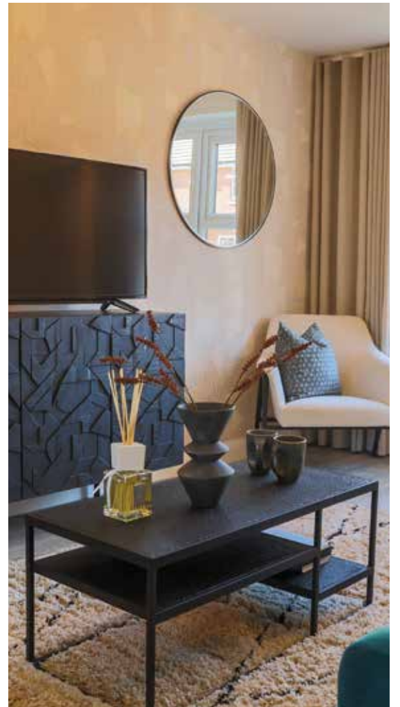
Images depict a typical L&Q show home