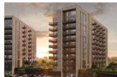
L&Q at Bankside Gardens Reading lqhomes.com/banksidegardens