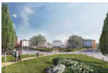
Beauchamp Park Warwick lqhomes.com/beauchamppark