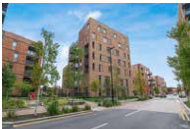
L&Q at Alexandra Gate Haringey lqhomes.com/alexandragate