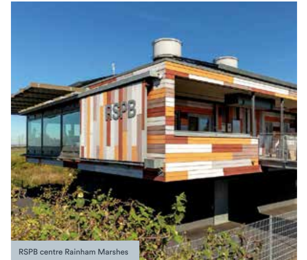
RSPB centre Rainham Marshes