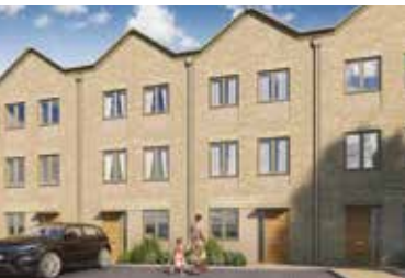
Barking Riverside Barking lqhomes.com/barkingriverside