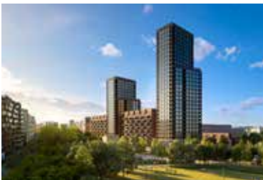
Prime Point Greenwich lqhomes.com/primepoint