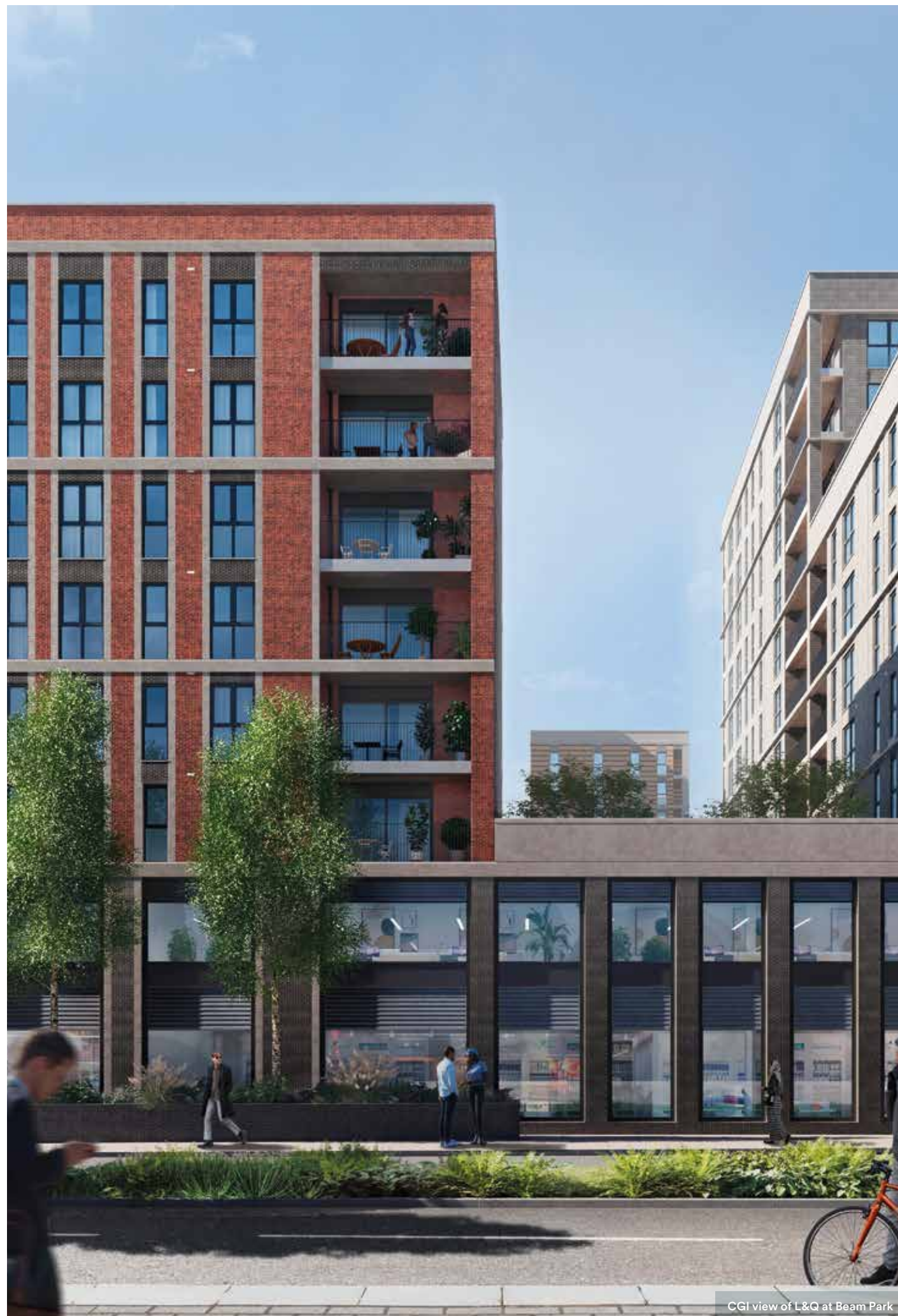
CGI view of L&Q at Beam Park