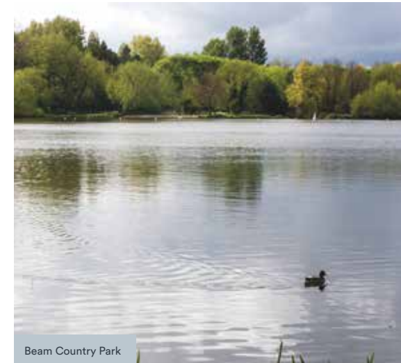
Beam Country Park