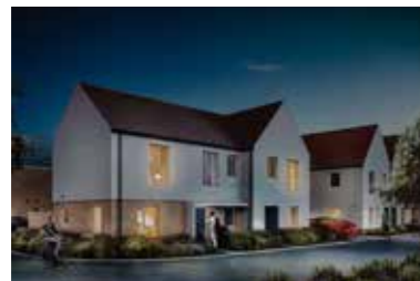
The Arbour, Beaulieu lqhomes.com/beaulieuarbour