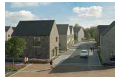
L&Q at Marleigh lqhomes.com/marleigh

L&Q at Beaulieu Centenary Way, Chelmsford, Essex, CM1 6TD