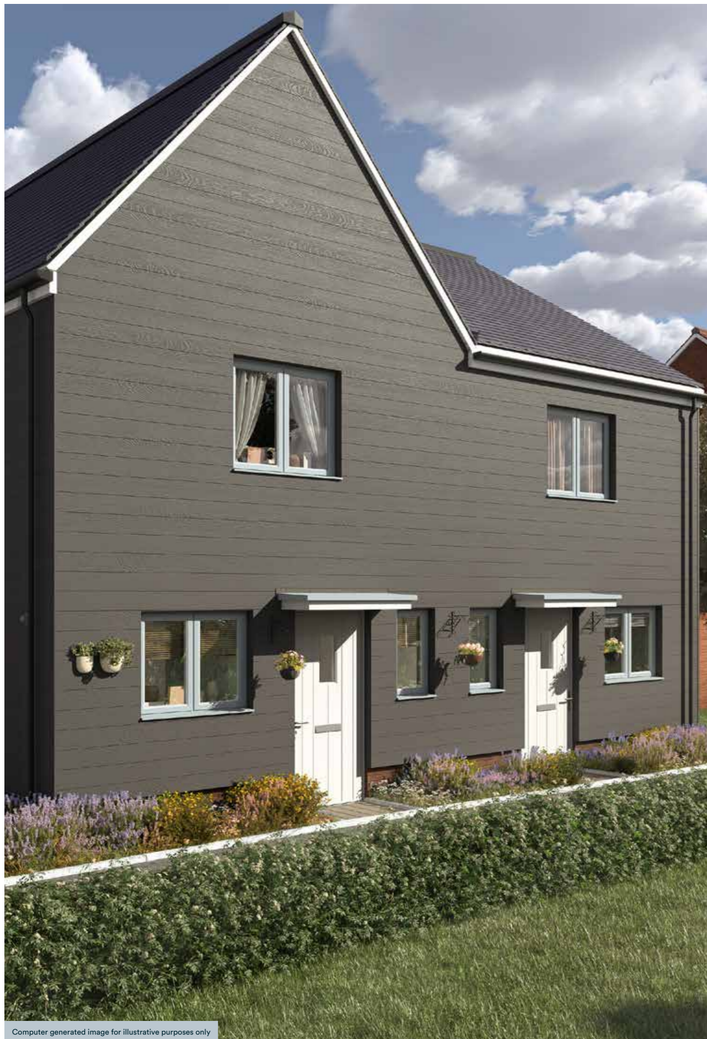
Computer generated image for illustrative purposes only