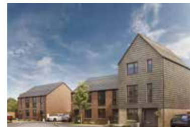
L&Q at Darwin Green, Cambridge lqhomes.com/darwingreen