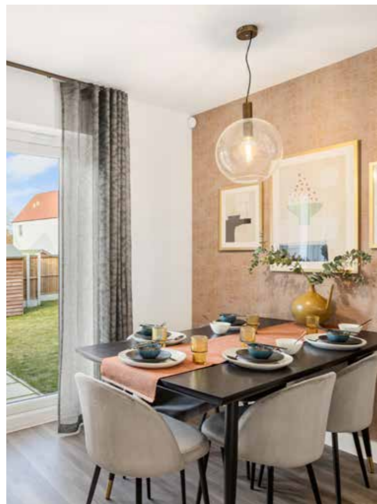
Images show a previous L&Q home