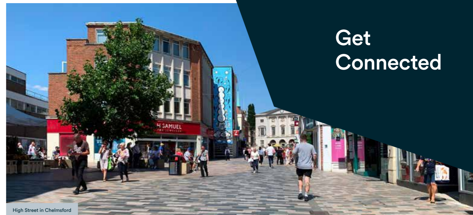
High Street in Chelmsford