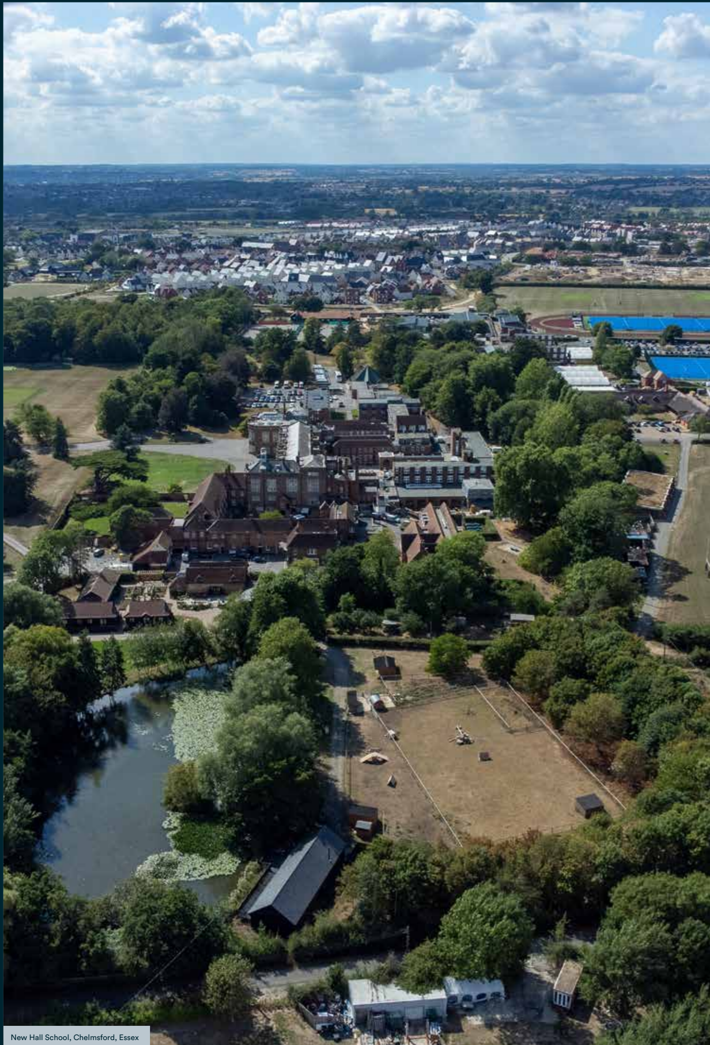
New Hall School, Chelmsford, Essex