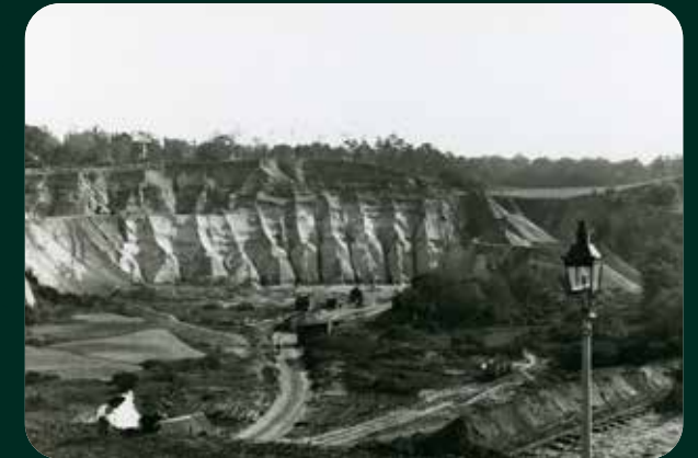
Loam pits, Erith

Today, the Riverside Festival marks the crucial role the Thames plays in the history, development and culture of Erith and its community.