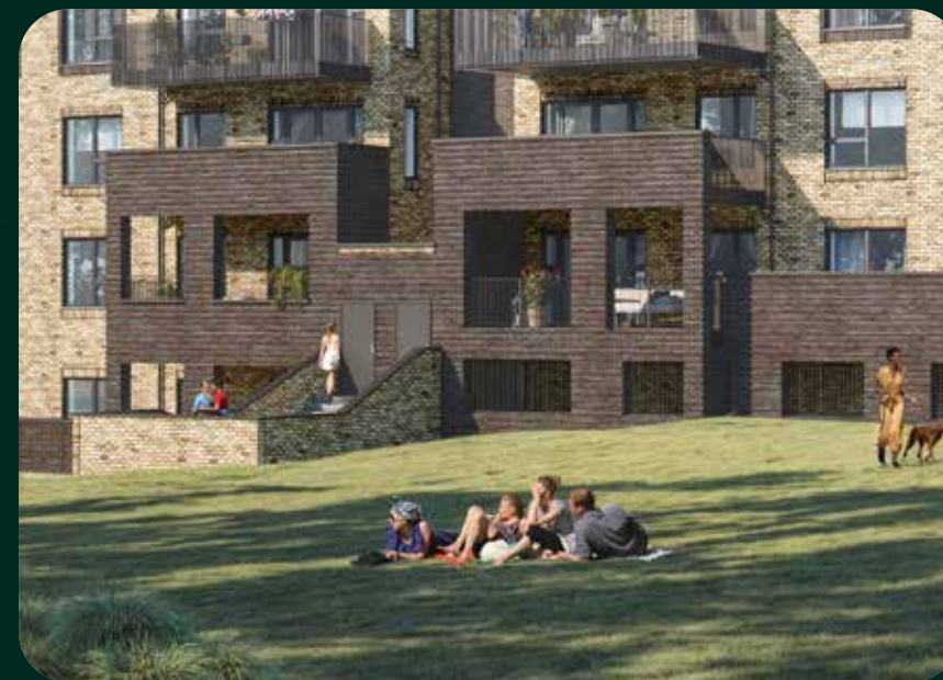
On-site Village Green