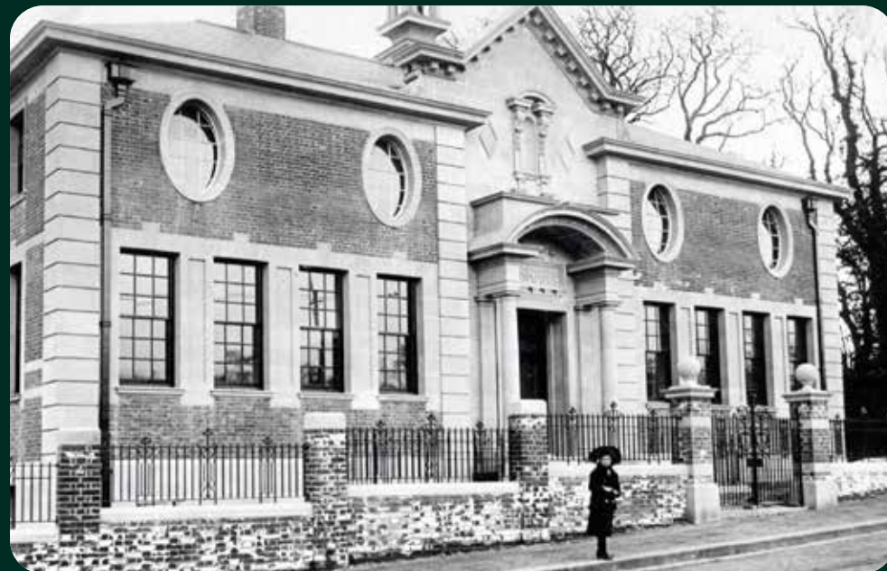
The Exchange, Erith.

Erith's tradition as a town known for manufacturing and innovation is continued at The Exchange.