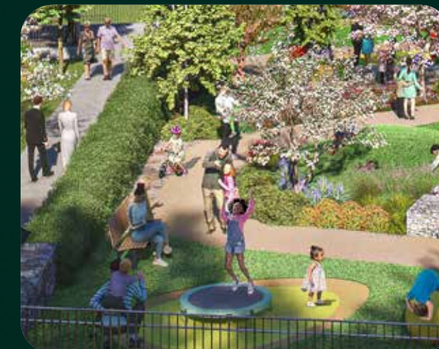
On-site Play Corridors