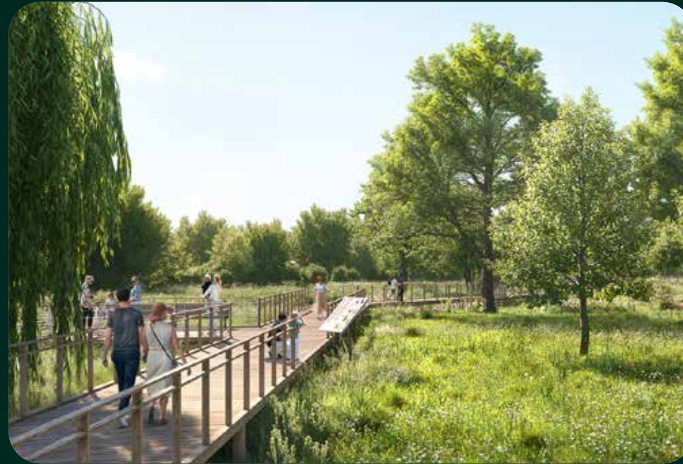
On-site Ecology Area