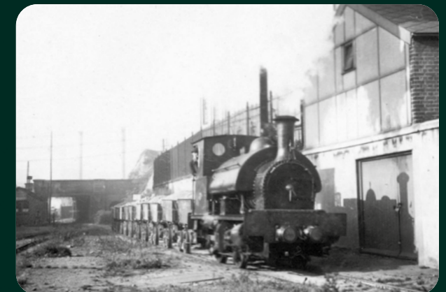
A train carrying loam from The Quarry to the Thames Pier

You can still see sections of the 4 ft gauge railway that was used to transport rocks and loam from The Quarry to the jetty on the Thames.