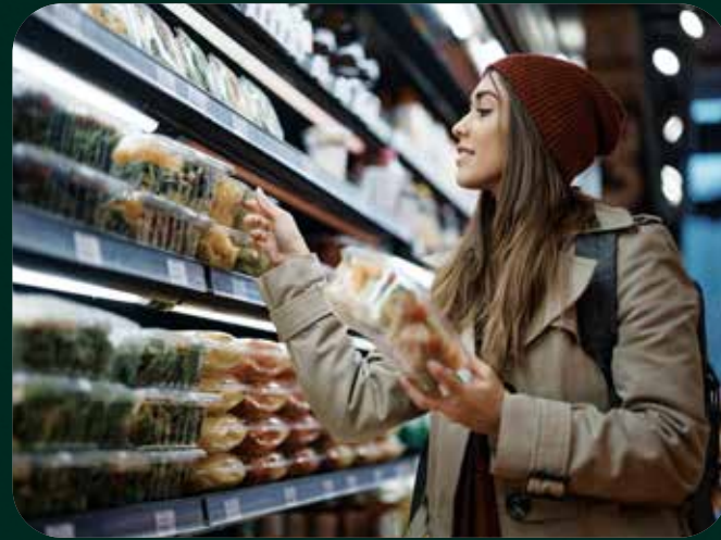
On-site Sainsbury's Local